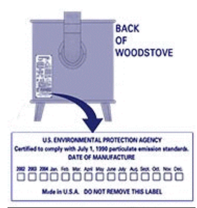
Permanent Wood Stove Label affixed to a stove